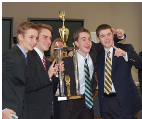
Cathedral High School students celebrate winning the 2012 We The People State Finals and their opportunity to compete at the national finals.

Inspiring students and increasing support from new and existing partners strengthened civic education in 2012. Your help has extended the Foundation's influence and all Hoosiers will benefit as more young people become engaged citizens.