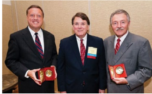
Sen. Brent Steele and Rep. Ed Koch received the Randall T. Shepard Award for creating legislation to aid pro bono service.

the 12 pro bono districts with grants of $750,000 annually through 2016. By then, it is optimistically anticipated that interest rates may return IOLTA funding to a level